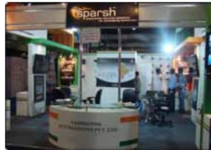
Sparsh Booth at IFSEC 2010, Mumbai

Celebrating the essence of theme India, Sparsh designed its Pavilion with Tri-coloured flag that attracted a lot of visitors. Emphasizing on Made in India Security Prod-