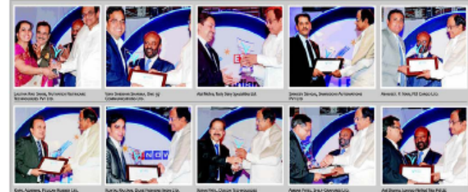
Tech Summit, 2010 at Coimbatore

ET NOW & IndiaMART.com has organized the Leaders of Tomorrow Awards, a unique initiative to recognize the finest entrepreneurial talent in the SME space.